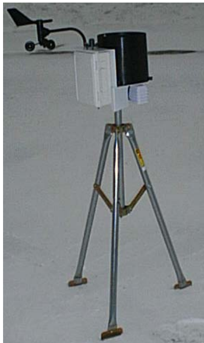
Weather Station mounted on tripod

If you are using the mounting tripod (item # 3396TP), open it and place it where the weather station is to be located. The tripod feet can also serve as mounting brackets if the unit is located on a solid surface. Slide the 3' post through both center screw clamps, adjust the height as desired and tighten the screws such that the post is perpendicular to the ground. Finally, attach the weather station to the post with the u-bolts.