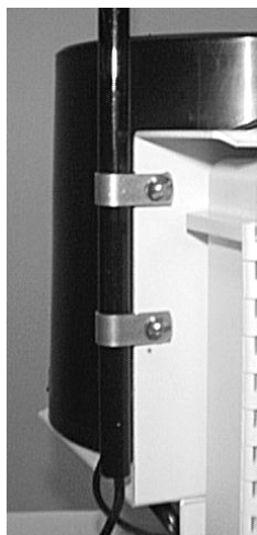
Anemometer clamped to back plate (unpainted clamps substituted for visibility)

Push the wind vane onto the top of the shaft and calibrate (see Calibrating the Anemometer p. 23 for calibration procedure).